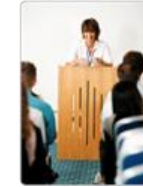
Table Topics --impromptu speech. Both members and guests can speak.

Prepared Speech --speech based on CC or AC manual. Only members can speak.